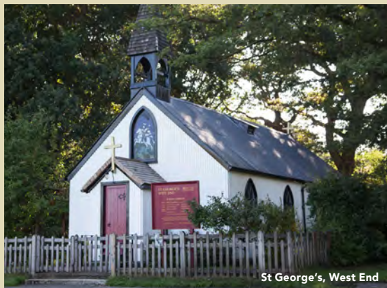
St George's, West End